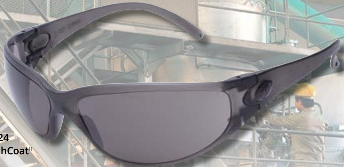
09251224 Gray / ScratchCoat □