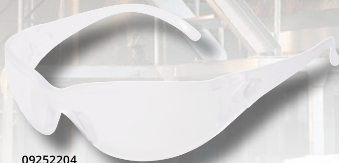
09252204 Clear / ENFOG □