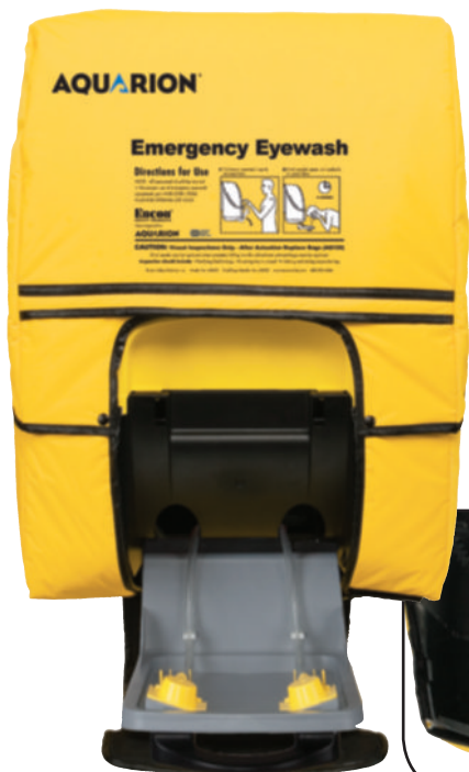
Top view showing heater guard.