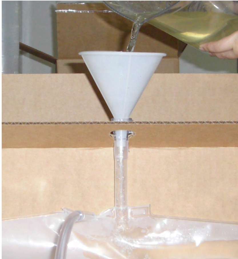
Figure 5: Funnel installed for filling.

Note: Filling the cartridge with the correct amount of water is critical to the system meeting the ANSI Z358.1 Standard.