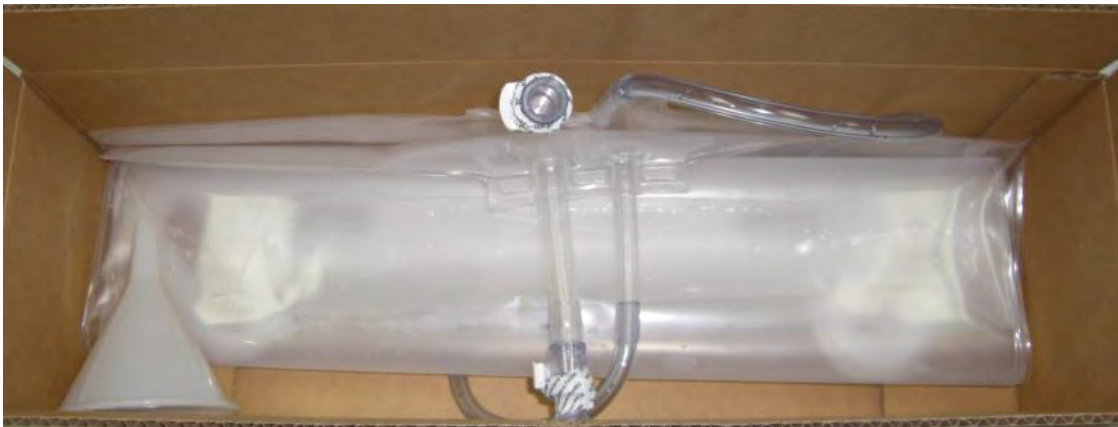
Figure 1: Fill Kit packed in Box.