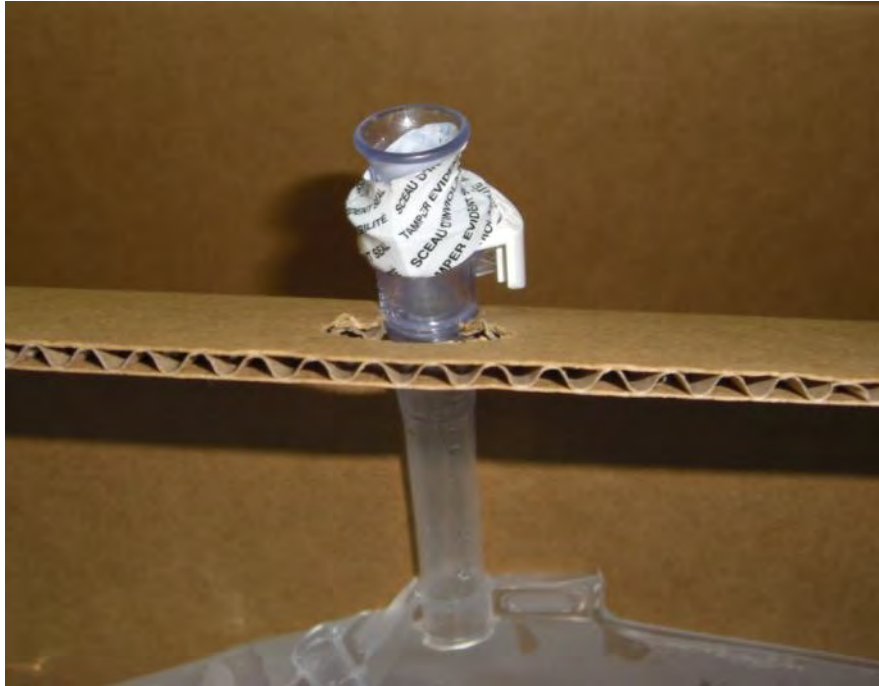
Figure 3: Aquarion Valve slid into slot.