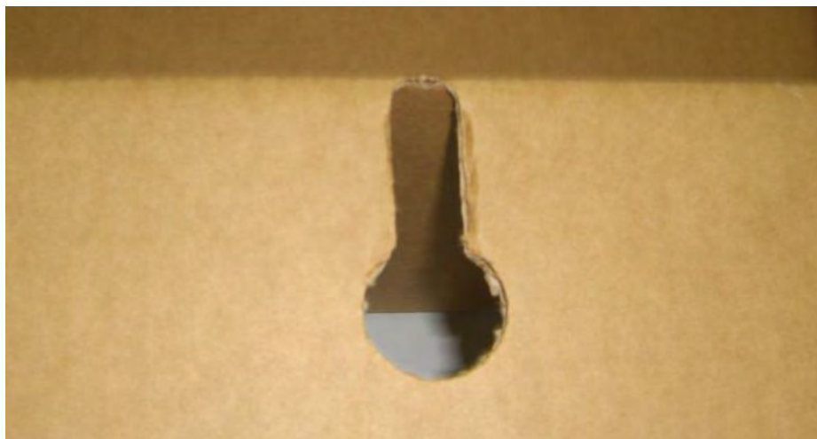
Figure 2: Perforation cut out.