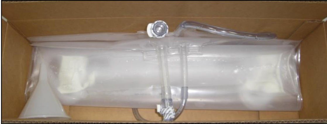
Figure 1: Fill Kit packed in Box.