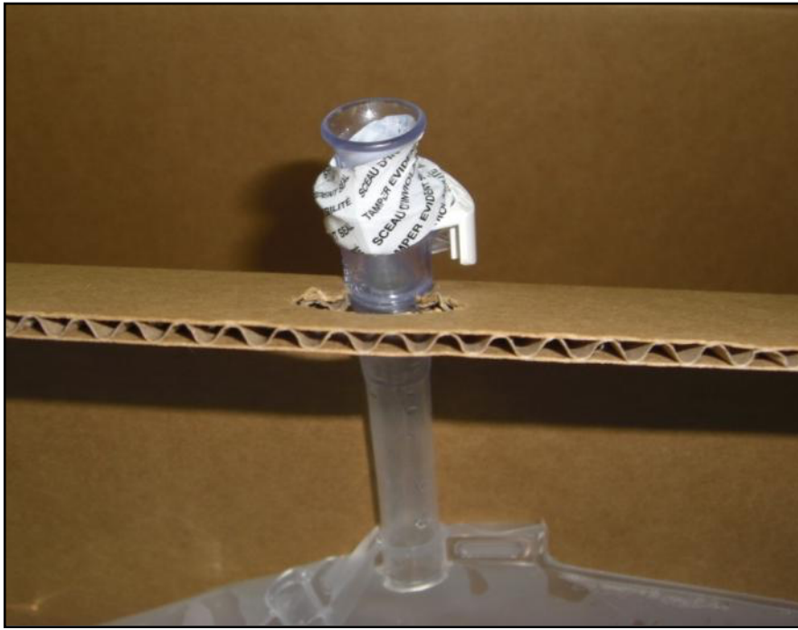
Figure 3: Aquarion® valve slid into slot.