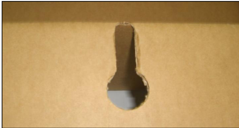
Figure 2: Perforation cut out.