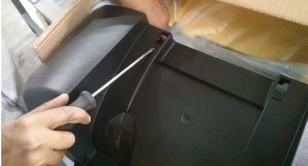
FIG. 2 – Use flat-head screw driver to pry off clip

The clip tray lock is easily removed by taking a flat-head screw driver and prying the clip from the base, see figure 2.